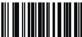
Cancel Set Date/Time

Scan the Cancel Set Date/Time bar code to cancel the date and time settings